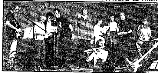
Naivelt campers serenade at closing banquet