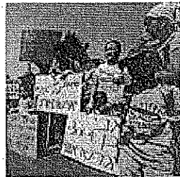
Protest against deportation of foreign workers' children

Israeli intelligence agents kidnapped him in Rome and brought him back to Israel to stand trial. Vanunu served 11 years of his 18-year sentence in solitary confinement. Israel has neither acknowledged nor denied having nuclear weapons.