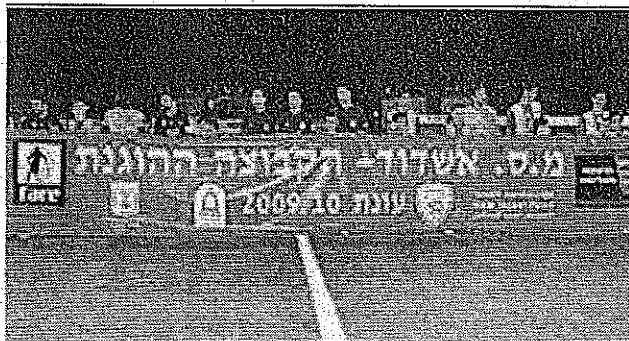
Ashdod fans receive the NIF Israel Football Association prize for the fairest fans in Israel. The prize includes soccer equipment and accessories.

11/06/10 — As the nations of the world gather together in South Africa for the World Cup, NIF's campaign to reduce racism in Israeli society through soccer - Kick Racism Out of Israeli Soccer - has reported its results for the 2009/10 season. Most encouraging was a 175 percent increase of educational activities by the clubs themselves this past season, and a 32 percent increase in fans condemning the racist behavior of fellow fans.