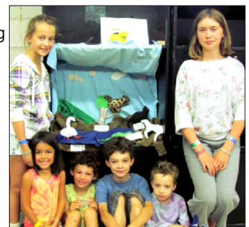
Stuffed animal workshop participants

It was another busy year for wildlife as well! Sightings this year included deer, wild turkeys and a