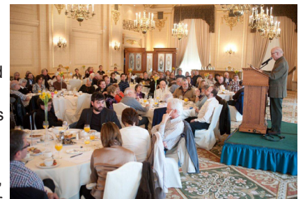
At the fundraiser

In the summer issue we closed this column with a sparse inkling of Camp Naivelt's summer programming, so we've